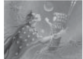
Spirits of Hope Coalition