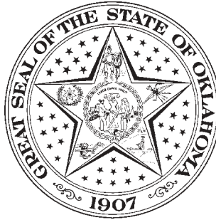
Oklahoma District Attorney's Council